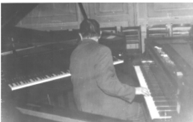
Figure 2: Free comparative estimation of pianos

Step 1: Open estimation. Three concert grand pianos - Leningrad-made, Hamburg Steinway, and Bechstein were placed on the stage of the conservatory concert hall. The experts were asked to play whatever they wanted and to compare the three pianos (Fig. 2) in three pitch ranges (bass, middle, and treble) with respect to tone quality, dynamic range, and playing comfort. The experts were asked to fill out forms, using (a) free verbalizations of their impressions, and (b) to rate the pianos by their tone, mechanical, and overall qualities. The last question on the form was whether the expert thought that (s)he would be able to discriminate the instruments by their tone quality only, if presented to tones, chords or scales played on the pianos.