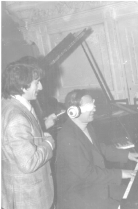
Figure 3: Kinesthetic test. The first author prepares to rotate one of the subjects

response, the sound. Since both feedbacks are the result of the performer's own activity, (s)he has strong expectations and thus a better perception of the details of the feedback, which are not available for the listener.